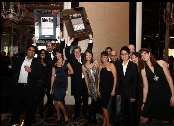
Smiles all around! DDB and Tribal DDB colleagues celebrate

In a tough economic year Tribal DDB has had a record new business wins, breakthrough campaigns, and, importantly, hard numbers to back up the effectiveness of its communication campaigns. It is a hugely proud moment for our network and is a real testament to the passion and hard work of the Tribal team across Asia – especially when 3 years ago Tribal DDB was just beginning here. This was made possible by our clients who were brave enough to come on the journey with us! We look forward to what’s in store for 2010.